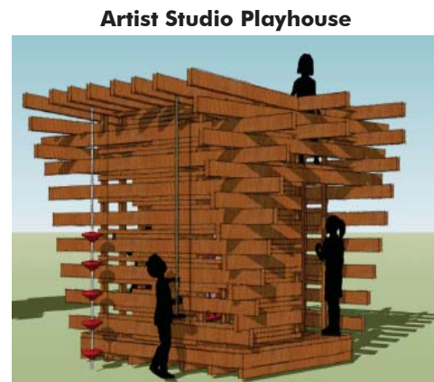
Artist Studio Playhouse

We selected our theme based upon the seemingly endless energy children have for exploration. Interior lighting will depend on the orientation of roof mounted solar panels which, in turn, create an educational and interactive opportunity for children.